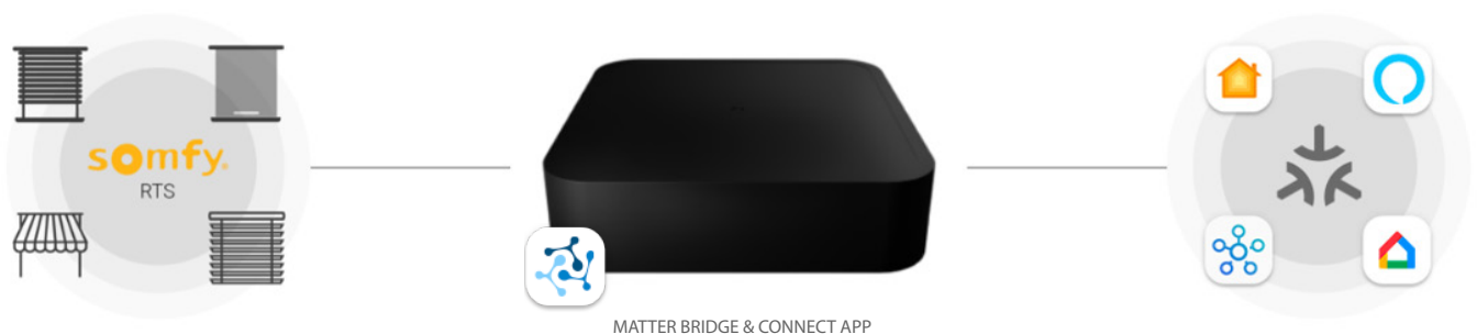
MATTER SMART HOME ECOSYSTEMS